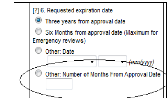
Figure 4: "Other: Number of Months from Approval Date" is a new field

Allows you to change the date in Part1 form Item #6. A new field called "Other: Number of Months From Approval Date" was created to allow clearing of the date field.